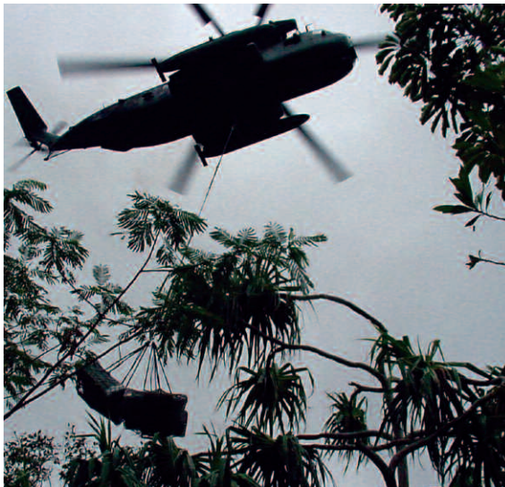
WAIKANE VALLEY IMPACT AREA-SITE WORK

Alan Shintani, Inc. also coordinates with services from adjunct firms of architects, engineers and a wide range of consultants from various disciplines and specialties to ensure that construction conforms to design criteria, quality and required details. Our company also has the combined in-house construction management personnel, quality control specialists and administrative personnel to produce a customized design package for each client.