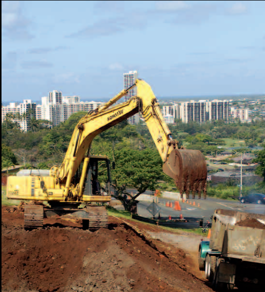
▲ U.S. ARMY CORP OF ENGINEERS NEW VISITOR CONTROL CENTER TRIPLER ARMY MEDICAL CENTER