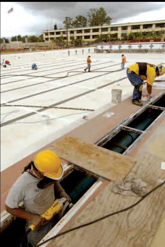
▼ U.S. ARMY CORP OF ENGINEERS RICHARDSON POOL SCHOFIELD BARRACKS - RENOVATION