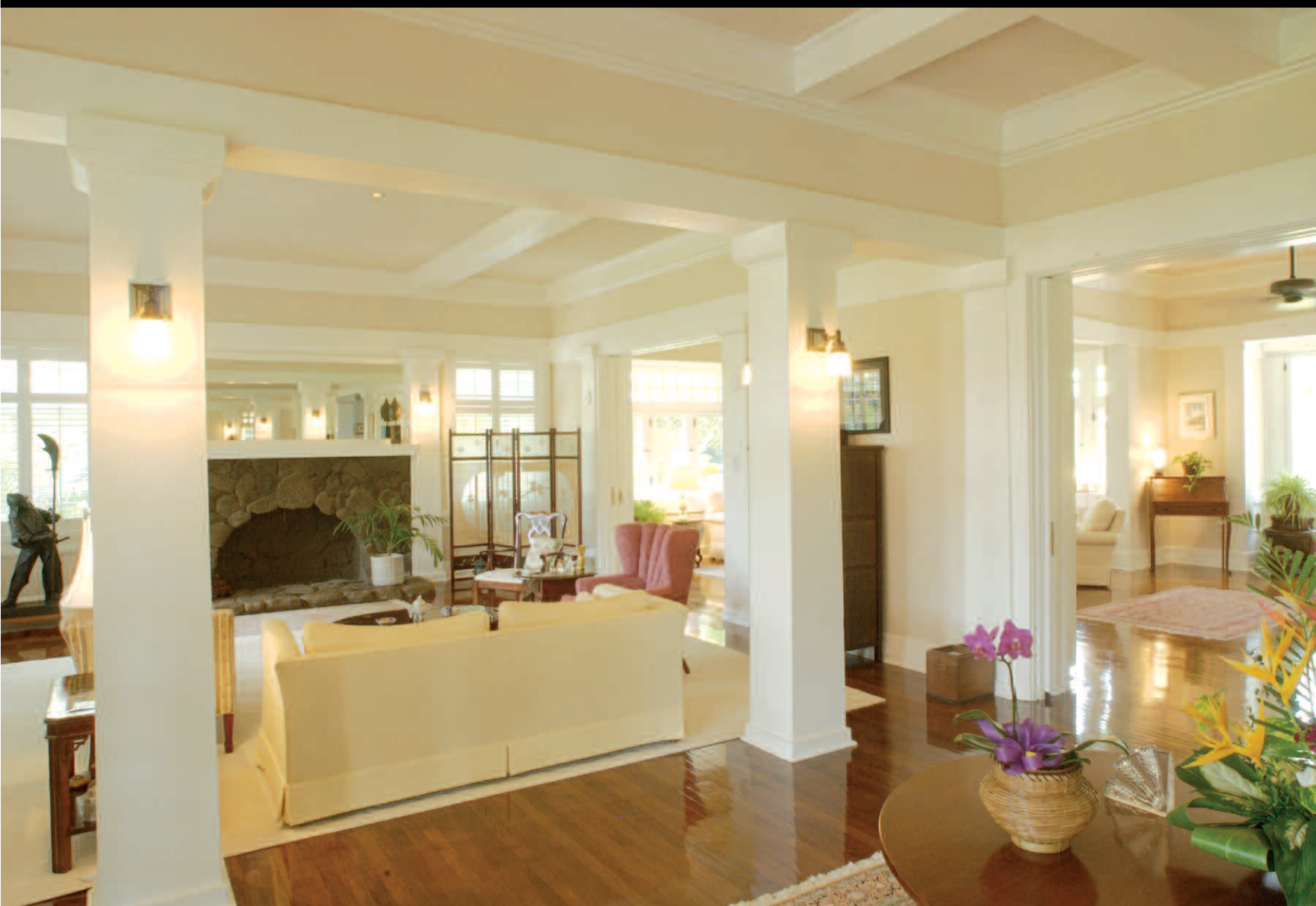
US NAVY - ROICC, PEARL HARBOR QUARTERS A, HALE ALI'I PEARL HARBOR - RENOVATION