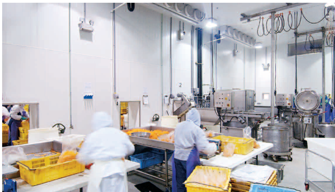
HONOLULU POI COMPANY

With a wide range of flexible and top-quality in-house capabilities and the ability to provide supportive subcontractors as well as a design-build team that brings in the project on time and within budget, Alan Shintani, Inc. is the solution to just about any construction project.