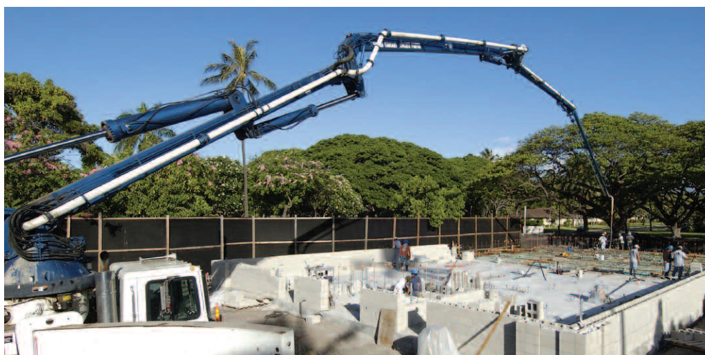
LIFE SKILLS CLINIC, HICKAM AIR FORCE BASE

Consultation is available for a variety of project needs ranging from architectural, civil, structural, mechanical, and electrical engineering disciplines within our company's home office. Alan Shintani, Inc. employs a staff of personnel with innovative design experience and maintains a working relationship with several design and engineering firms to form unique collaborations. These collaborations ensure clients receive inventive ideas that can be implemented into a finished quality product.